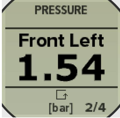
Keep pressing the LEFT button at startup to start in sequence mode.